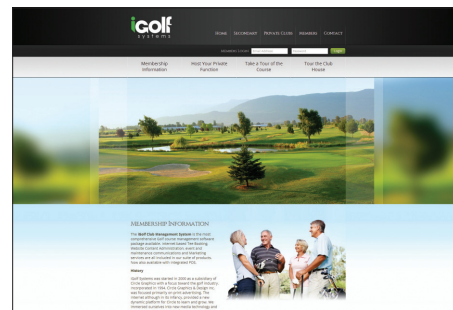
SAMPLE WEB SITE

The iGolf System has been built, developed and tested solely on information we have gathered from experienced golf professionals and managers. This invaluable input has allowed iGolf to implement features based on your needs. This is why iGolf has received so many rave reviews.